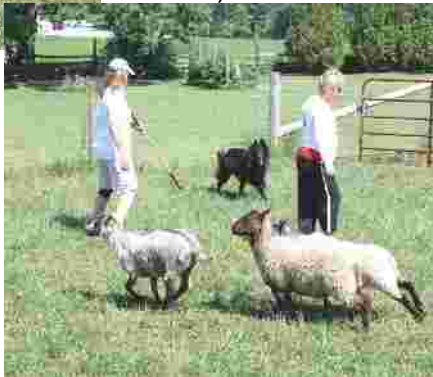
Right - 12 yr old Literacy Assistance and Therapy Dog 'Koukla' showing that even seniors still love to work.