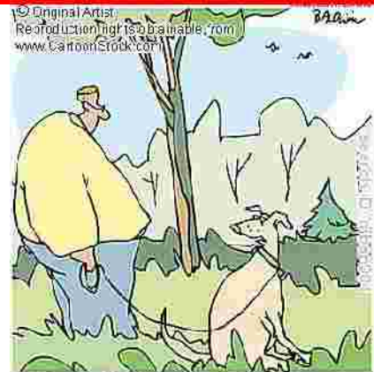
"Great. It's the call of the wild, and you've got me on hold."

Just like people, dogs can get sunburned – white dogs and dogs with very short or sparse hair can also develop sunburn where their skin is exposed. Sunscreens (SPF should be 15 or greater), including those developed specifically for pets and those containing titanium dioxide as the active ingredient should be used to prevent sunburn. For pets with skin exposed on their bodies a t-shirt should be worn (by the dogs, naturally!).