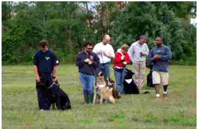
In Shutzhund Obedience training – 2004 (4 th in line)