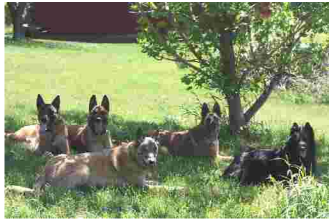
The Spirit Ridge pack in early June 2011 (since then, we have also lost our "Tequila" (back left))