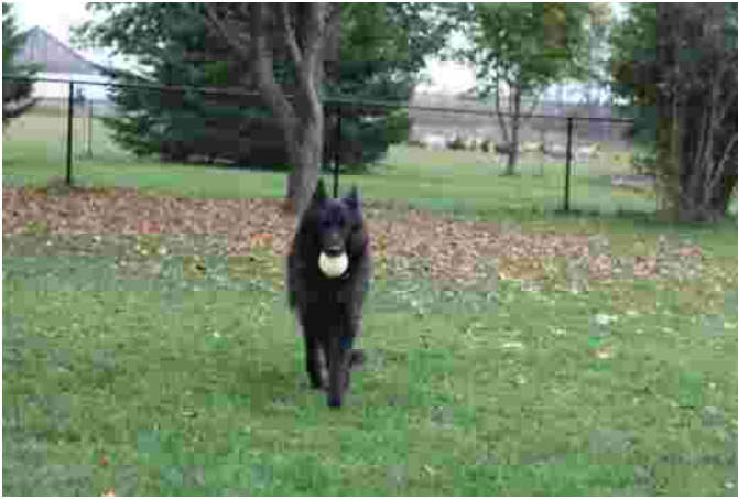
Koukla's last public outing – Canadian Thanksgiving 2011 (Oct. 10, 2011)