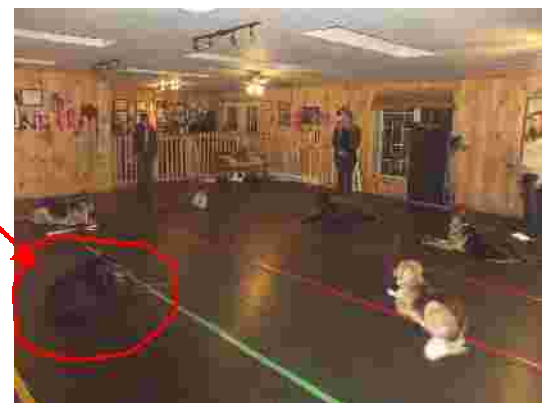
Miss Carla in class